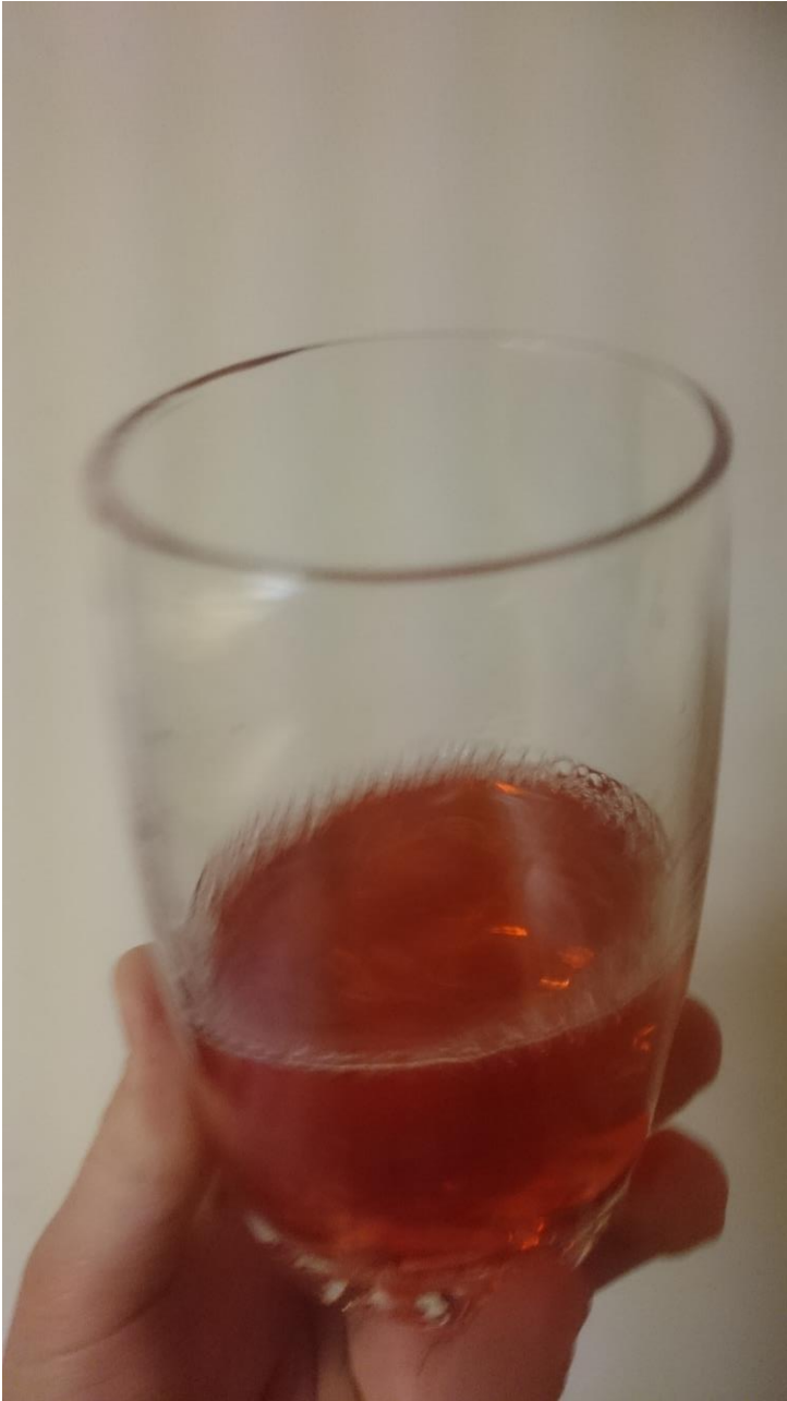
Picture 3. When rotating the juice in the glass, the juice is trying to maintain its momentum inside of the glass because of inertia.